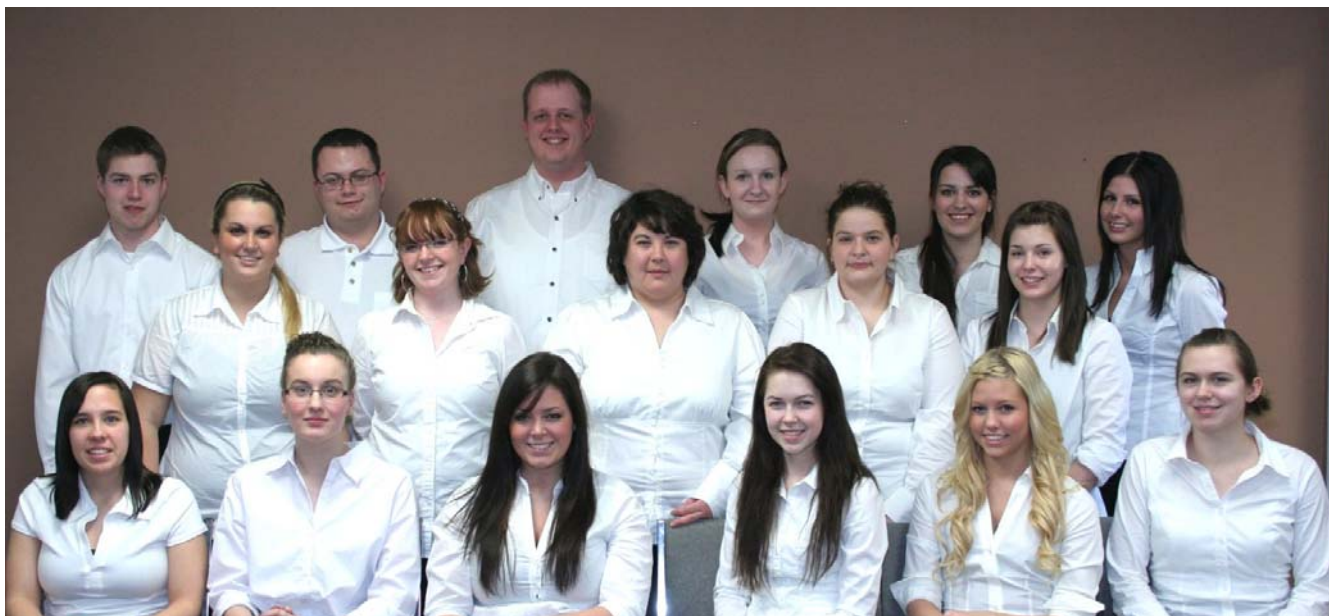
"The current Pharmacy Technician class - first in the province to graduate under the new national standards."

Thompson Career College ( www.ThompsonCC.ca ) can be reached by toll-free phone at (877) 840-0888, or by email at info@ThompsonCC.ca .